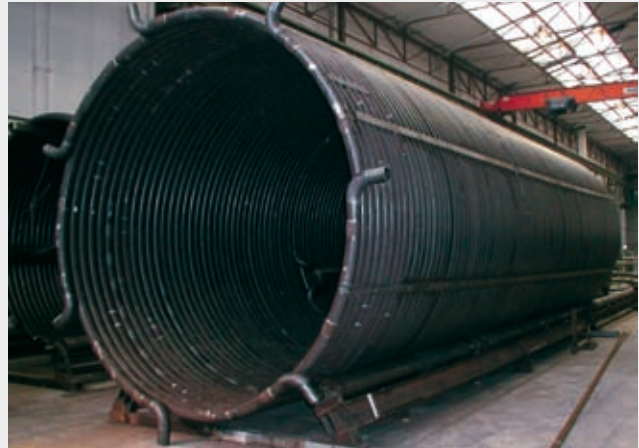
Production of coils:

In order to achieve high safety standards, INTEC thermal oil systems comply with the regulations of the German Industrial Norm DIN 4754.