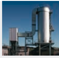
Waste heat boilers