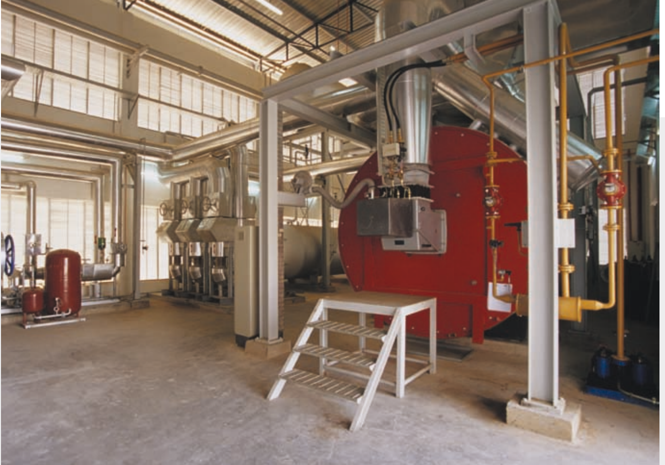
Thermal oil heater with a capacity of 10MW, Malaysia (with preheated combusted air)

The thermal oil heaters and the required burners are tailored to suit the requirements of their respective applications.