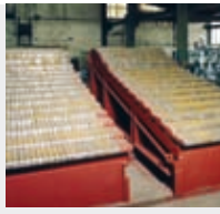
Solid fuel firing systems