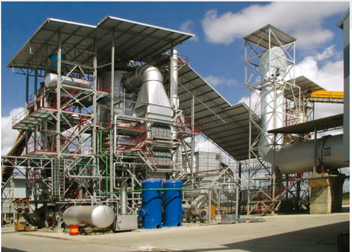
Solid fuel firing plant with sander dust combustion, output 24 MW, Thailand

INTEC step grates, with output capacity up to 60 MW, are employed in the food industry for the generation of electrical power, using rice husk and rice straw as fuels. Net electrical output reaches capacities up to 10 MW.