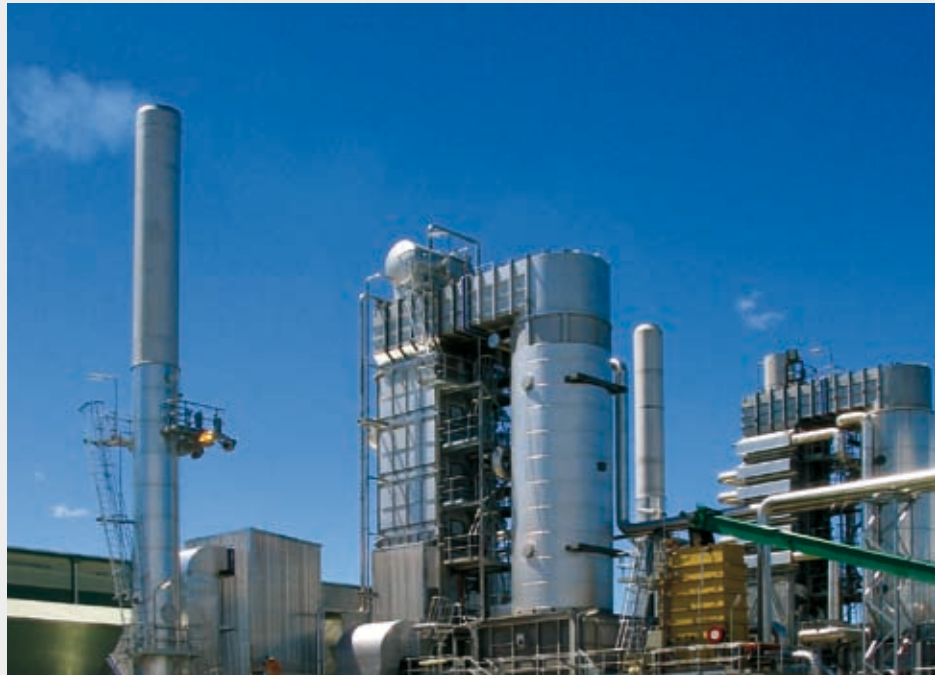
Combination of a radiation heater with convection heat exchanger in meander design with a thermal oil output of 28 MW used to heat a saw-mill in Australia

INTEC offers you tailor-made solutions for a wide variety of applications: