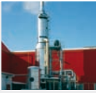
Thermal oil heaters