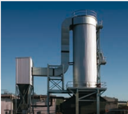
Thermal oil heater fired with solid fuels in three-pass design, output 12MW, Australia

In order to recover the heat contained in the waste gas coming from solid fuel firing systems, combustions engines, gas turbines or other industrial processes, it is indispensable to possess detailed knowledge about the properties of the respective waste gas flows.