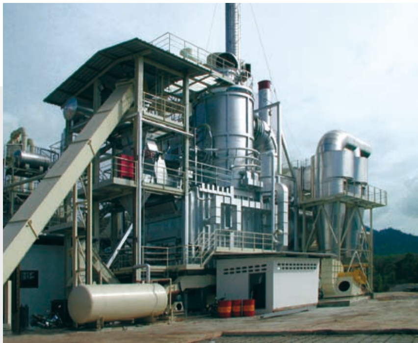
Hot gas generator with grate firing system and sanderdust combustion, output 11 MW, Thailand

Matched to different requirements and fuels diverse firing systems are offered by INTEC: