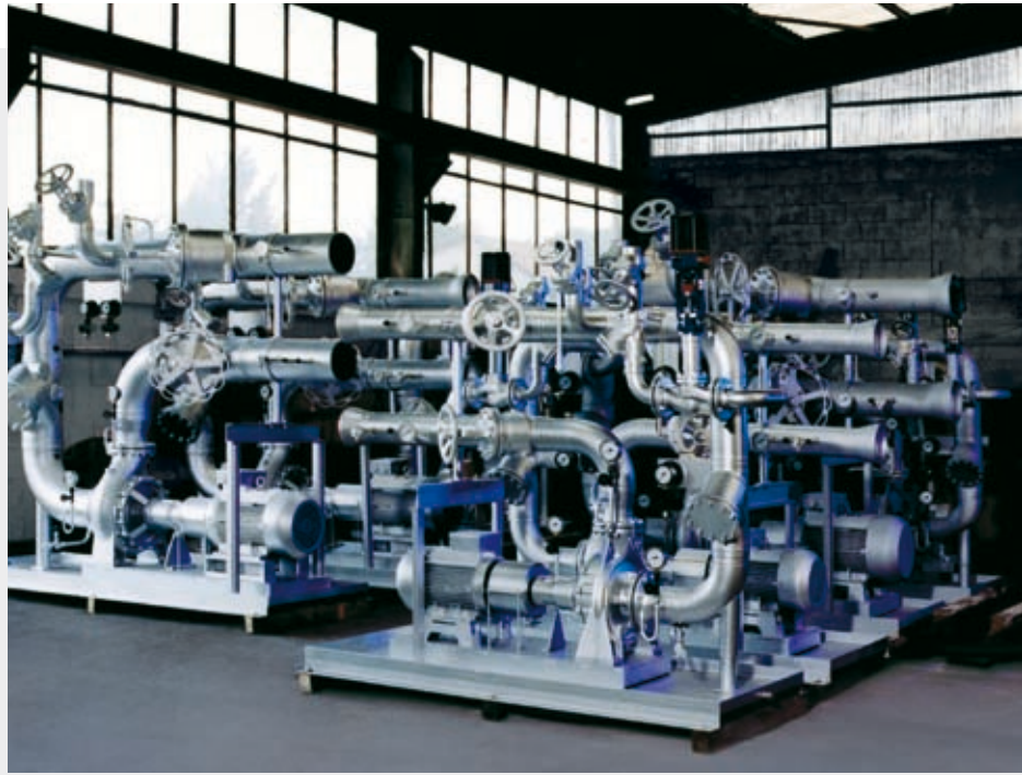
Secondary control circuits for heating of a continuous press (CPS)

INTEC secondary control circuits are delivered as completely preassembled systems. INTEC supplies these circuits worldwide for heating presses, impregnation plants, coating plants in the wood, textile and paper industries. Combined heating and cooling systems are particularly applied in the plastics industry.