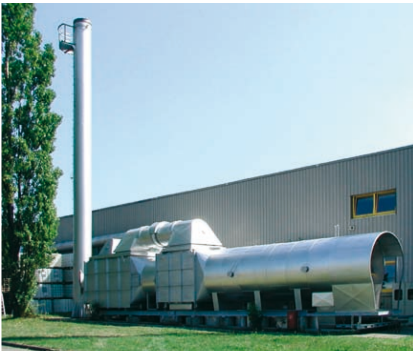
Thermal incineration unit for decontamination of exhaust air loaded with solvent, 20,000\text{Nm}^3/\text{h}