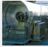
Thermal exhaust air decontamination