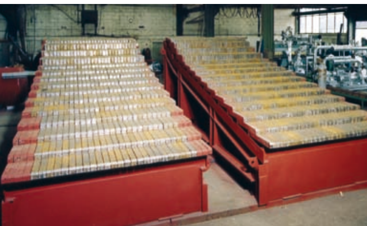
Step grate for the combustion of biomass

As a complete solution for the wood and fibreboard industries INTEC offers hot gas generators with capacities up to 90MW. Depending on the individual operation requirements, the process heat is transferred by hot gas, thermal oil, steam or hot water to the consumers.